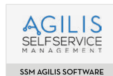
SSM AGILIS SOFTWARE