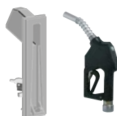
NOZZLE SWITCH WITH A60