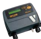
TANK LEVEL INDICATOR