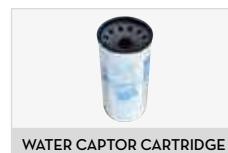
WATER CAPTOR CARTRIDGE