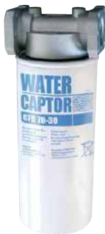
70 L/MIN WATER CAPTOR WITH WATER ABSORPTION