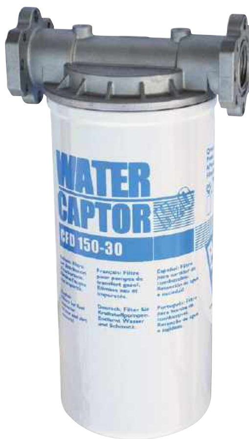
WATER CAPTOR 150 L/MIN