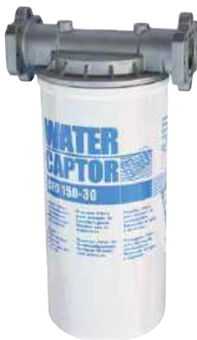
150 L/MIN WATER CAPTOR WITH WATER ABSORPTION