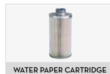
WATER PAPER CARTRIDGE