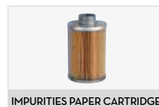
IMPURITIES PAPER CARTRIDGE