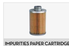
IMPURITIES PAPER CARTRIDGE