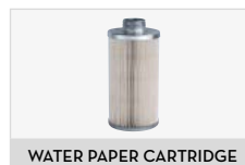
WATER PAPER CARTRIDGE