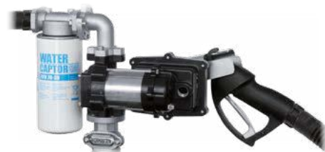
EX50 DRUM WITH MANUAL NOZZLE

OUR PUMPS COMPLIES WITH THE FOLLOWING MARKING ATEX/IECEx