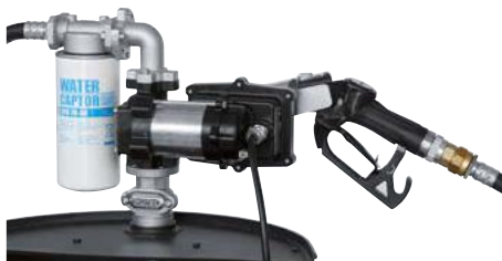
EX50 DRUM WITH AUTOMATIC NOZZLE