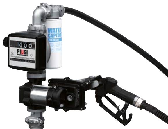
PIUSI EX50 DRUM WITH METER AND FILTER

The PIUSI EX50 DRUM is a complete pump transfer kit expressly engineered for ATEX/IECEx areas. This system is composed of a high-efficiency pump, manual or automatic nozzle and a telescopic suction hose. Thanks to the flanged components, this transfer set allows users to replace any component without using sealants thus creating maximum versatility and adaptability to any kind of condition. K33 mechanical meter available on request.